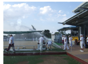
Dolphins & Gaythorne players