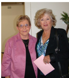
Coffs Harbour Weekend

"La Piazza", 21 Bayview Street, Runaway Bay, time: 12 noon. All Dolphin members to bring a $5 gift.