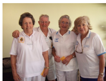
L ~ Gaythorne players